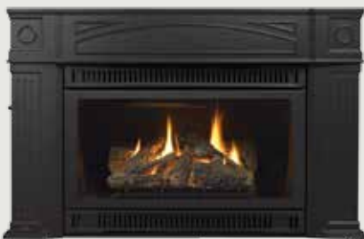
Hampton cast iron fascia (while stocks last)

Above: I-31 shown with black louvres and slim line fascia